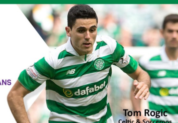
Tom Rogic Celtic & Socceros